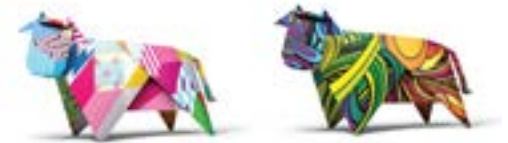
HP SmartStream Mosaic one-of-a-kind designs.